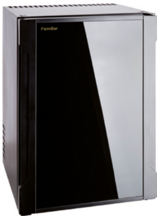
S30T - SOLID DOOR