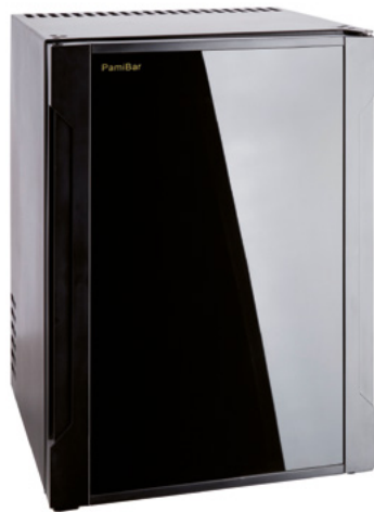
S40T - SOLID DOOR