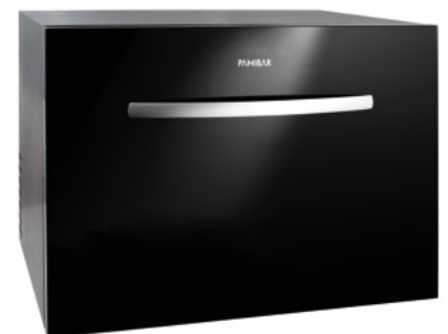
SEA 40DX - DRAWER MINIBAR